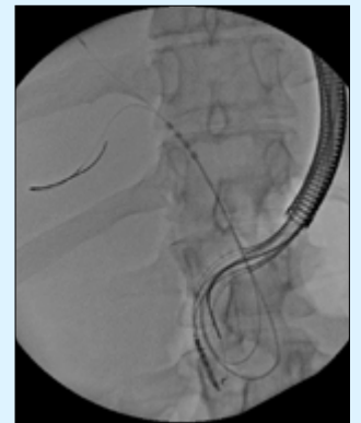
Figure 1: The radiotranslucent tip made it easy to position the RF ablation probe

The translucent tip of the aScope Duodeno was a very useful feature for instrumentation inside the bile ducts. The water irrigation was also notably much more powerful, and the noise level was unusually low compared to reusable endoscopes. Overall, the clinical performance was such that we were not cognizant of the fact that we were using a single-use endoscope during the procedure.