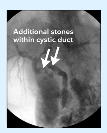
Figure 3: Fluoroscopy showing additional stones within the abnormally draining cystic duct.

The balloon catheter was advanced through the cystic duct into the gallbladder aided by guide wire, but attempts at stone removal failed. The stones were then pushed into the gallbladder by flushing the cystic duct with saline.