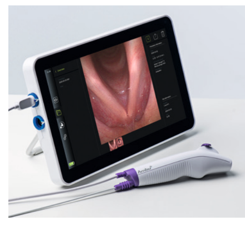
Ambu<sup>®</sup> aScope<sup>™</sup> 4 RhinoLaryngo Slim and Ambu<sup>®</sup> aView<sup>™</sup> 2 Advance