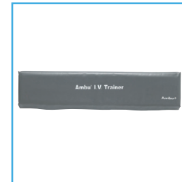
Packed in a robust bag