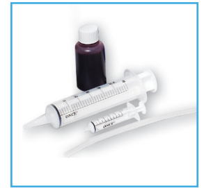
Accessories for Ambu IV Trainer