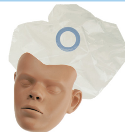
Ambu's unique Hygienic System