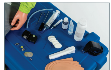
Accessories incl. in packaging