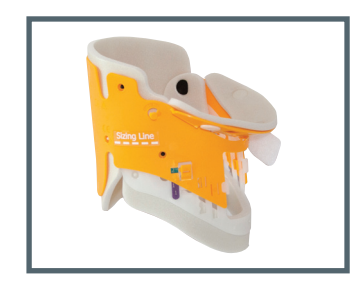
Ambu Redi-ACE Mini