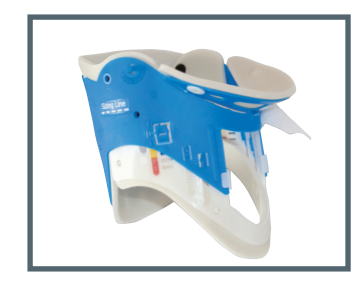
Ambu Redi-ACE Adult