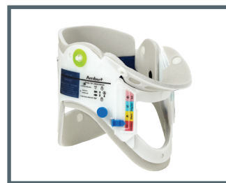
Ambu® Perfit ACE®