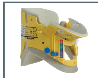
Ambu® Mini Perfit ACE®