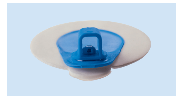
A = 4 mm fitting