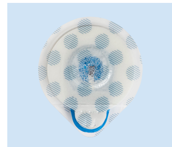
Printed release liner