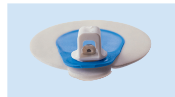
F = 3 mm fitting