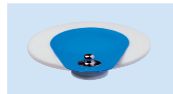
S = Stud