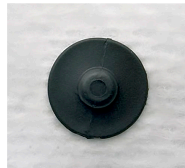
S/RT = Graphite Stud