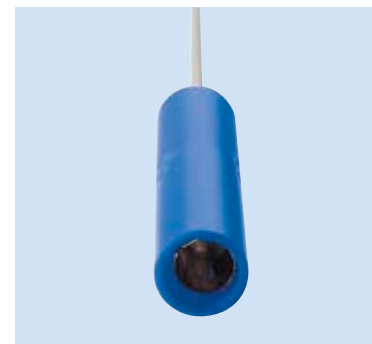
A = 4 mm connector