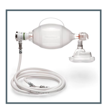
The new versions can also be connected to a demand valve