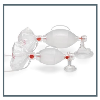
The demand valve version is available in adult and paediatric sizes