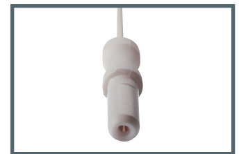
K = 1,5 mm connector