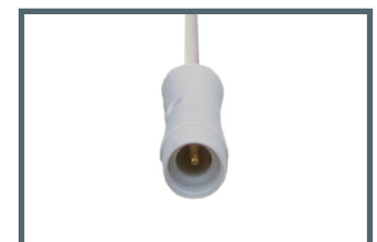
SC = 0.7 mm connector