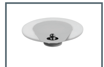
S = Stud