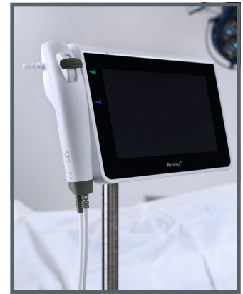
Ambu® aScope™ 4 Broncho Slim and Ambu® aView™