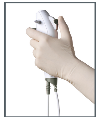
Ergonomic and lightweight handle designed to give you a firm and comfortable grip