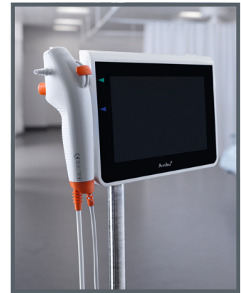
Ambu® aScope™ 4 Broncho Large and Ambu® aView™