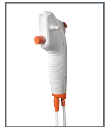
The ergonomic and lightweight handle is designed to give you a firm and comfortable grip