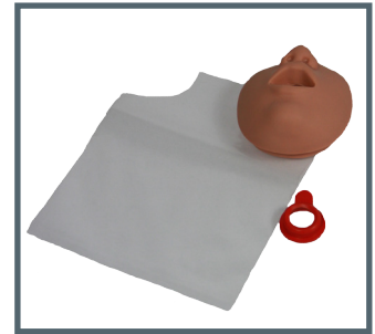
Ambu hygienic system