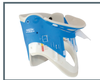
Ambu Redi-ACE Adult