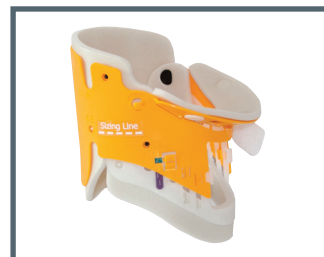
Ambu Redi-ACE Mini