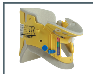
Ambu® Mini Perfit ACE®