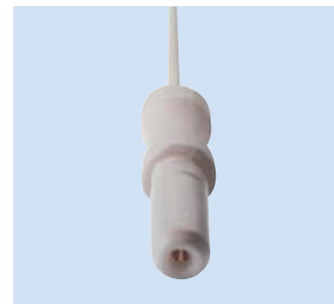
K = 1.5 mm connector